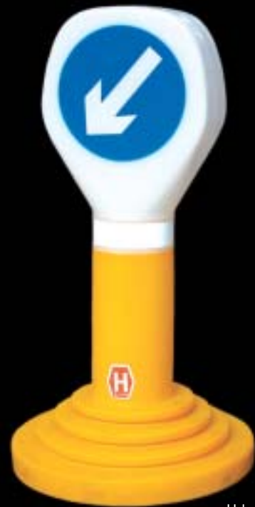
Halo Bollard Shell