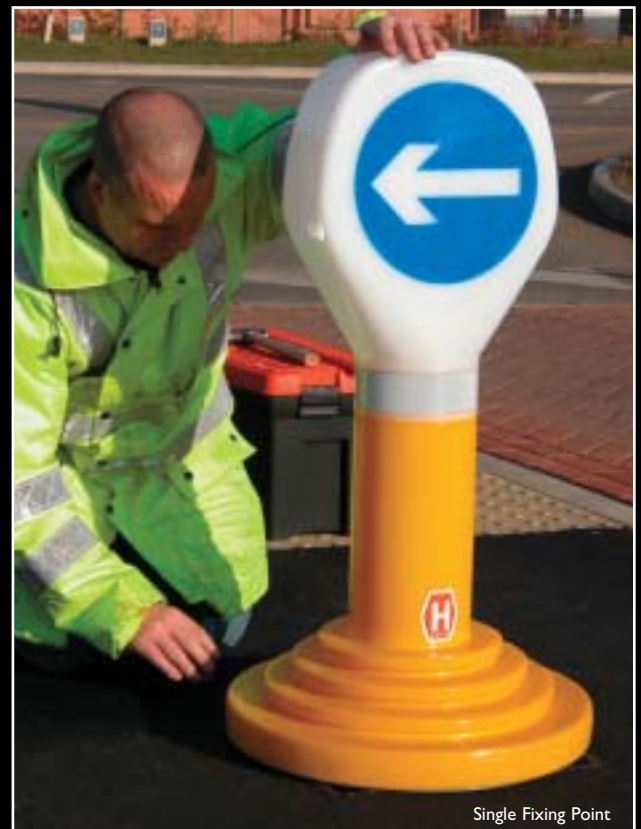
Single Fixing Point