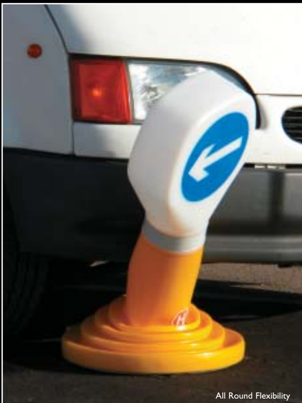
All Round Flexibility