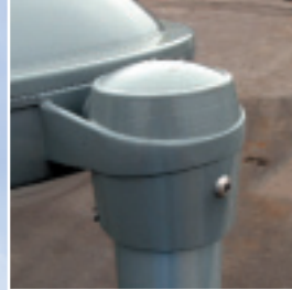
Security fixing bolt