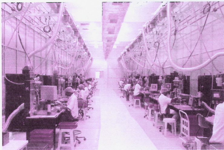
Boost India's lamp-making industry will benefit from the switch

Delhi-based Havells bought Sylvania for £155 million in March 2007.