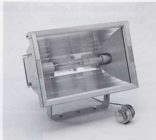
150 WATT SON/T; C/W T/HALOGEN BACK-UP AND PHOTOCELL

A wide range of floodlights for security applications. Manufactured from corrosion resistant aluminium alloy and protected to IP65.