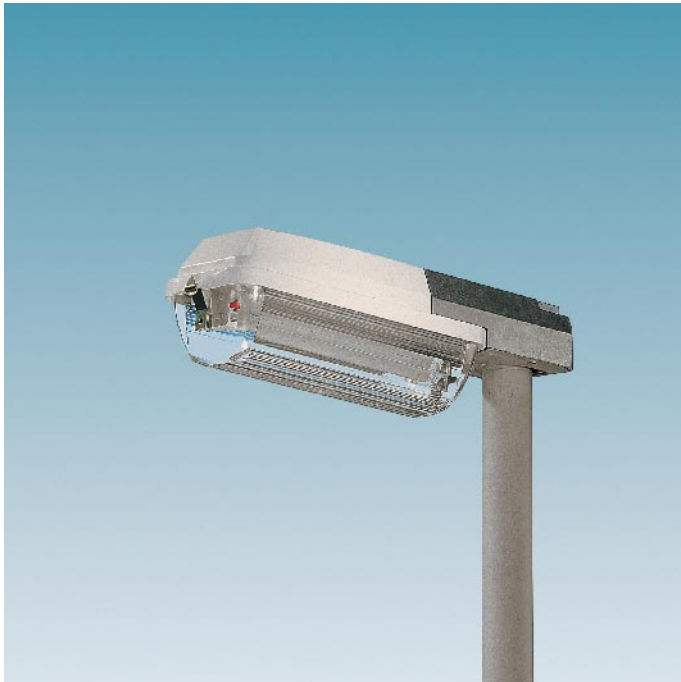
FIXGS 103 post top mounting