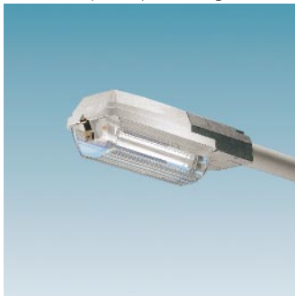
FIXGS 103 side entry mounting